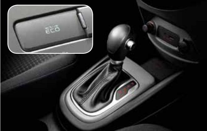
6-speed automatic with Active ECO